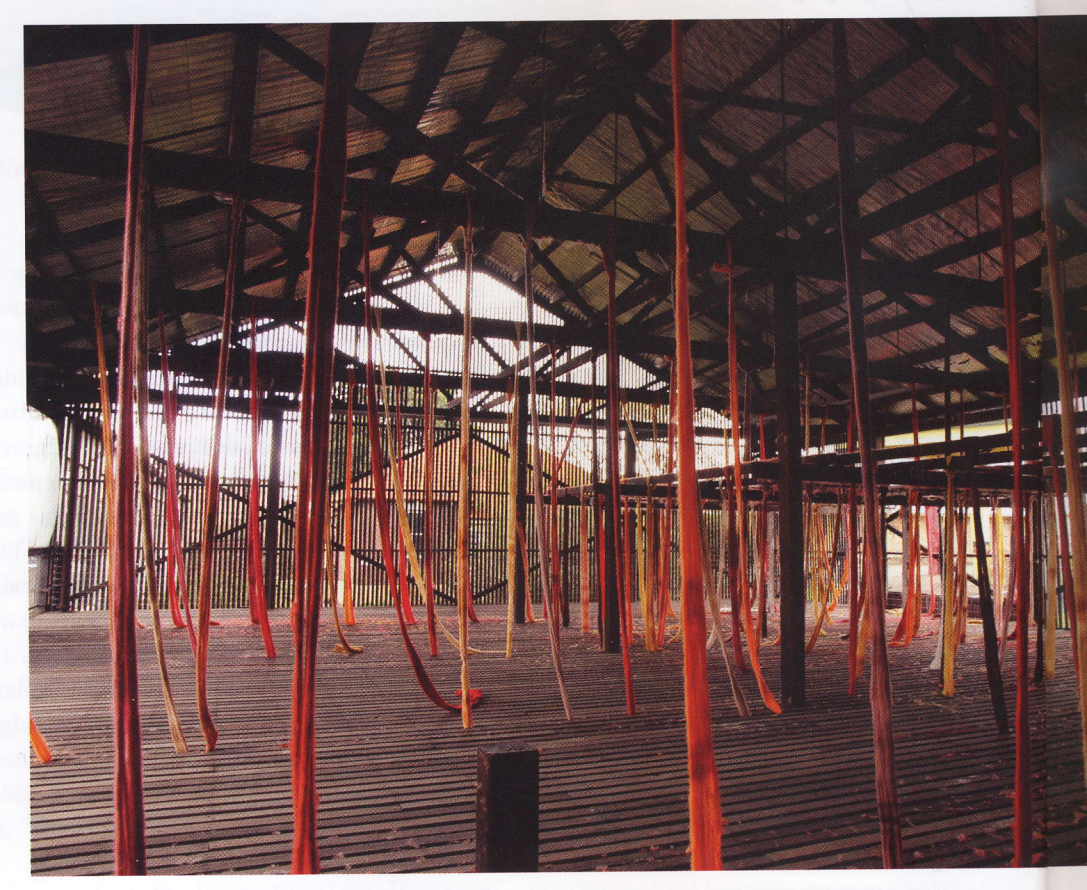
ABOVE Cecilia Vicuña's 2012 installation, Quipu Austral , at the 18th Sydney Biennale, Cockatoo Island.